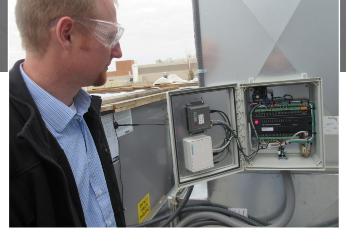
VOLTTRON™ capabilities, installed in building systems, can help the grid manage the challenges posed by wind and solar energy.

could include pre-cooling a building or turning on a water heater system, ultimately help stabilize the grid. Improved stability also can be achieved through "ancillary services" approaches. This involves grid operators periodically asking buildings or other entities to quickly reduce or increase loads to address dynamic grid conditions. VOLTTRONTM can provide sub-minute responses to the requests, adjusting building devices, such as air-handler fans, to address the immediate need. Similarly, VOLTTRONTM has demonstrated effectiveness in managing traditional demand response approaches.